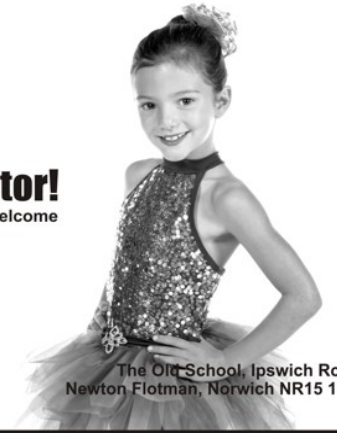
The Old School, Ipswich Road Newton Flotman, Norwich NR15 1PN

Tel: 01508 471792 www.artstheatreschool.com