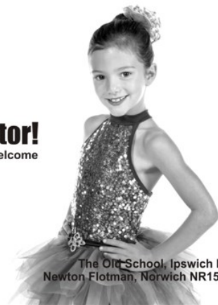
The Old School, Ipswich Road Newton Flotman, Norwich NR15 1PN

...discover your star factor! every age and ability welcome